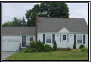
Warwick affordable homeownership, 3 bedrooms, 2 baths