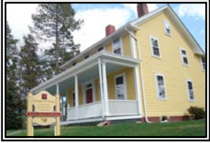
3188 Post Road, Warwick administrative offices of House of Hope CDC