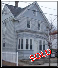
Cranston affordable homeownership, 4 bedrooms, 1.5 baths