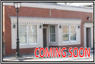
3190 Post Road, Warwick will become retail store and production facility for House of Hope Boutique