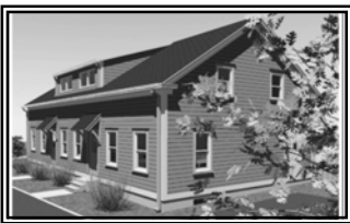
West Warwick will provide 2 units of low income housing owned and managed by the Kent Center