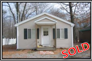
Warwick affordable homeownership, 2 bedrooms, 1 bath