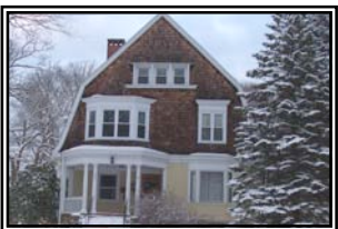
Wakefield will provide 6 units of permanent supportive housing for low income households with a disabled adult for Opportunities Unlimited clients