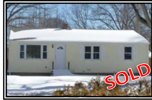
Warwick affordable homeownership, 3 bedrooms, 2 baths