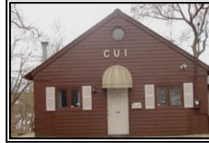
3194 Post Road, Warwick social services offices of House of Hope CDC