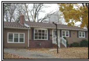
Warwick affordable homeownership, 3 bedrooms, 2 baths