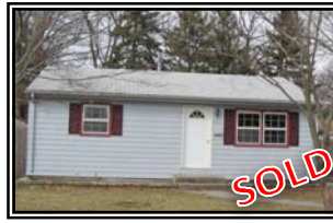
Warwick affordable homeownership, 2 bedrooms, 1 bath